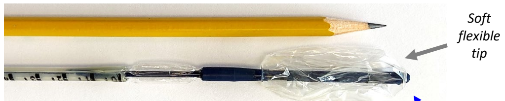
The mcompass ® Anorectal Manometry Catheter