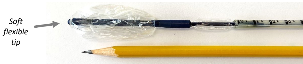
The mcompass ® Anorectal Manometry Catheter